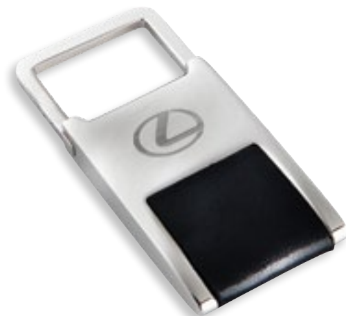
CALLAWAY® CHROME KEY TAG Sophisticated pull-and-turn lock key tag is accented with luxurious leather. Embossed on back with a Callaway imprint. Length: 2.25" 00625-19143-100