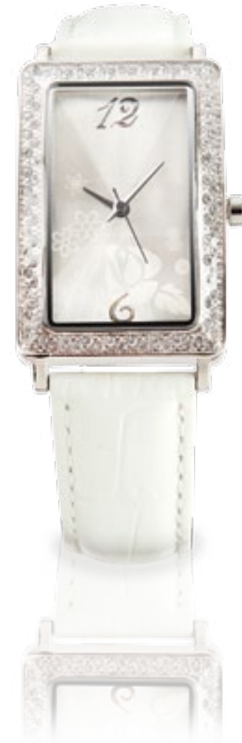
CRYSTAL WATCH With 88 pieces of Swarovski® crystal embedded on its case, this watch makes a dazzling statement. Unique tone-on-tone floral pattern dial. Leather strap. Lexus "L" engraved on back. 00625-19146-700