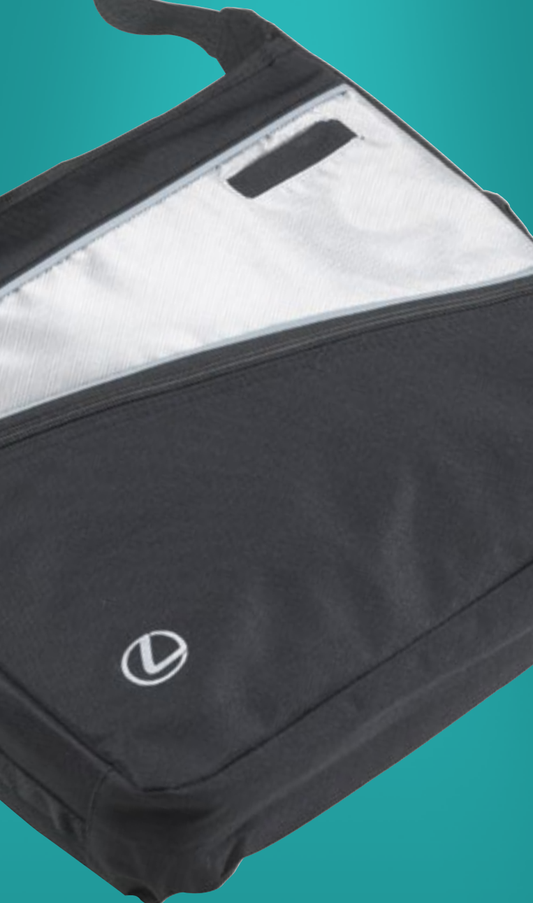
LAPTOP MESSENGER BAG Sturdy polycanvas bag designed for business people on the go. Has a removable padded laptop sleeve plus lots of convenient storage space. Black with gray inset. 16" W x 13" H 00625-19140-300