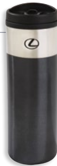
TWO-TONE TRAVEL TUMBLER Slim-design stainless and chrome tumbler is double-wall insulated to keep beverages hot. Twist-on lid with slide lock prevents spills. Hand wash. 16 oz. 00625-19142-100