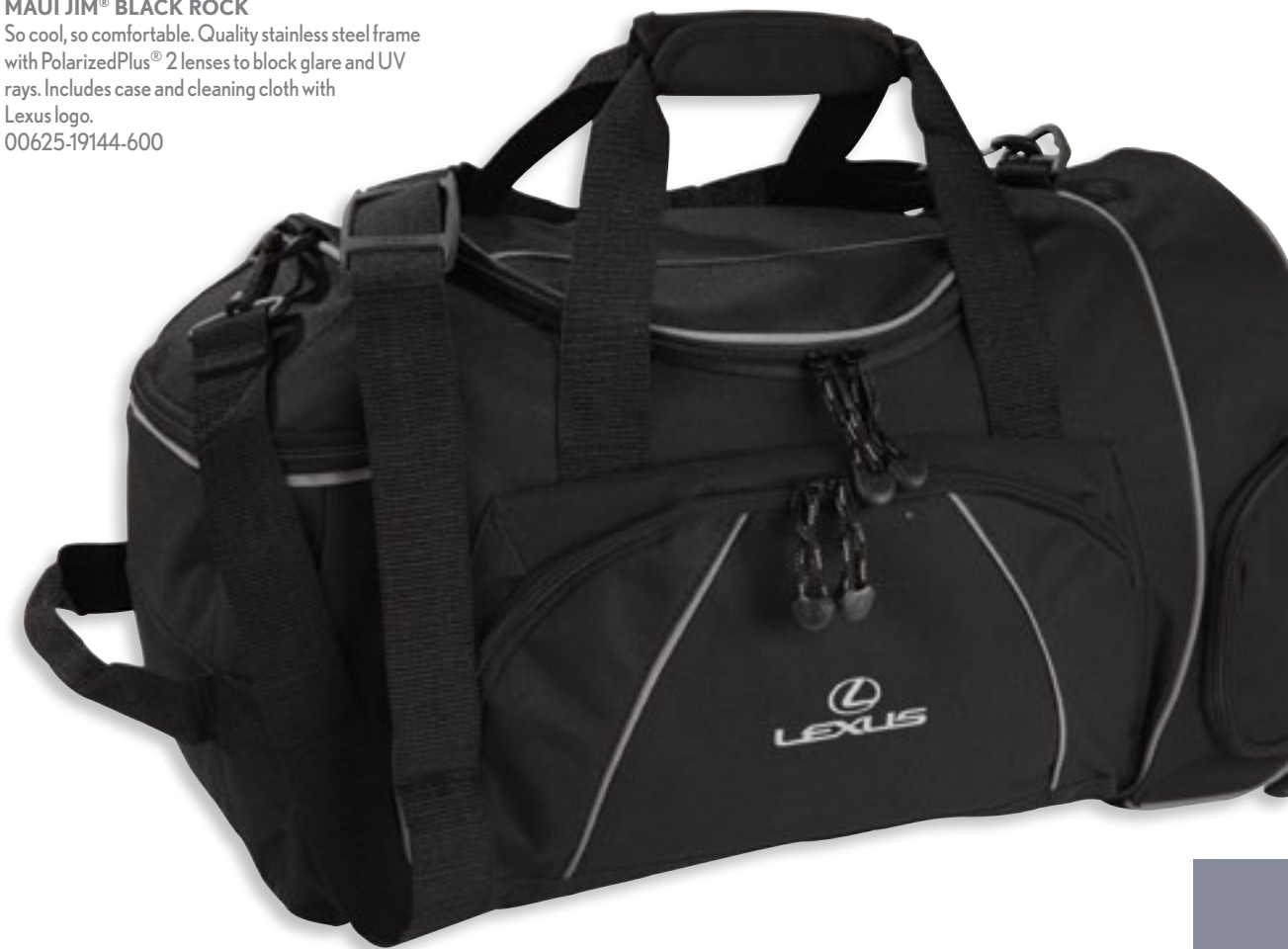
LEXUS SPORT DUFFEL Pack in sport or weekend wear, and off you go. Large 20" zippered interior, shoe pouch and front and side pockets hold all your gear. 00625-19140-200