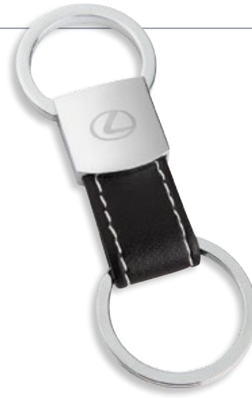
THE VENETO KEY RING Laser-engraved split-ring key holder with pull-top mechanism. Black leather with polished chrome finish. Length: 3.5" 00625-19143-500