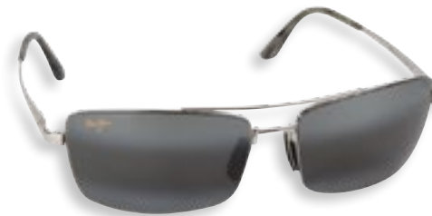
MAUI JIM® BLACK ROCK So cool, so comfortable. Quality stainless steel frame with PolarizedPlus® 2 lenses to block glare and UV rays. Includes case and cleaning cloth with Lexus logo. 00625-19144-600