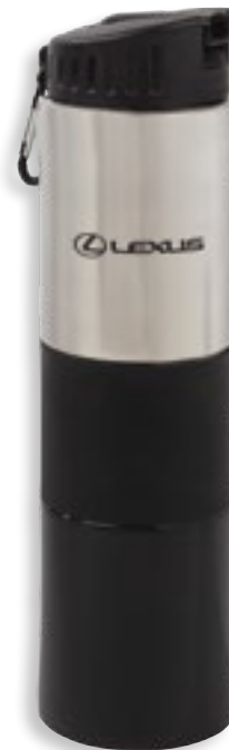
CALLAWAY® STAINLESS STEEL WATER BOTTLE Lightweight bottle has a rubber grip, twist-on lid with pull-up spout, and carabiner clip. In velvet drawstring pouch. Hand wash. 25 oz. 00625-19142-000