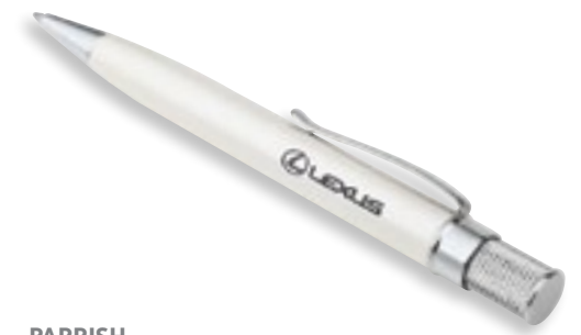
PARRISH Solid brass pen has an opulent pearl finish with diamond-cut detailing and chrome accents. Twist-action mechanism. 00625-19131-800