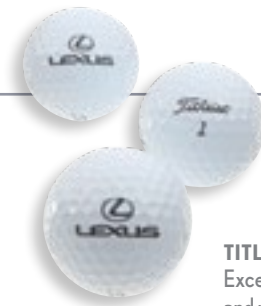
TITLEIST® PRO V1 Exceptional distance, durability and performance elevate the Titleist® Pro V1 series from the rest. One dozen. 00625-19010-000