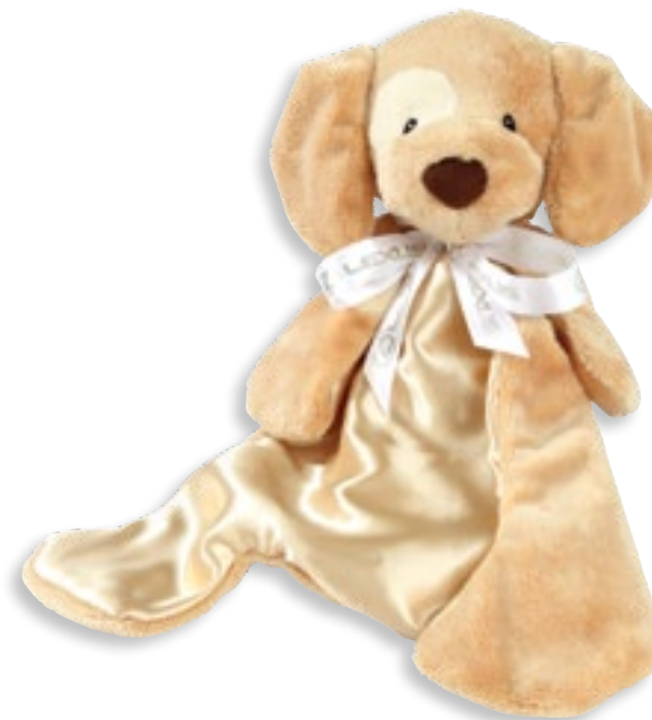
MY HUGGYBUDDY Super-soft puppy with satin underside is the perfect cuddle friend for baby. Machine washable. Length: 15" 00625-19147-700