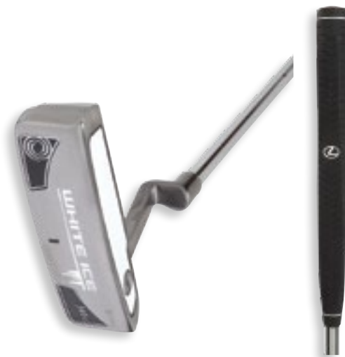
ODYSSEY® WHITE ICE #1 PUTTER Combines Tour-trusted shapes with a new look and better feel for enhanced responsiveness and consistency. Matching head cover included. 00625-19145-999