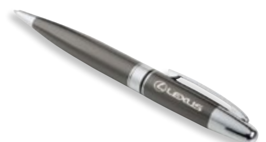
CHROMIUM You can't miss this pen's classic styling and heavy, solid brass character—or its smooth, twist-action operation. 00625-19132-000