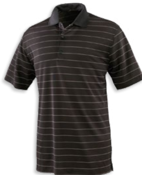
PLAY DRY® PERFORMANCE POLO Quality and fine detailing from Greg Norman. Advanced moisture wicking and UPF 30+ sun protection, embroidered shark on back neck. Lexus logo on left sleeve. 97% polyester, 3% spandex. M-XXL 00625-19145-49* Azure 00625-19145-39* Black