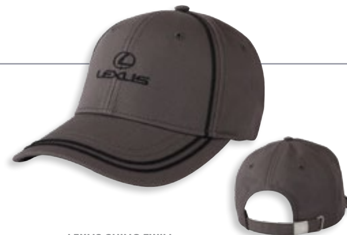
LEXUS CHINO TWILL Structured chino twill cap. Clip buckle on back is embossed with Lexus "L." Slate. One size. 00625-19142-900