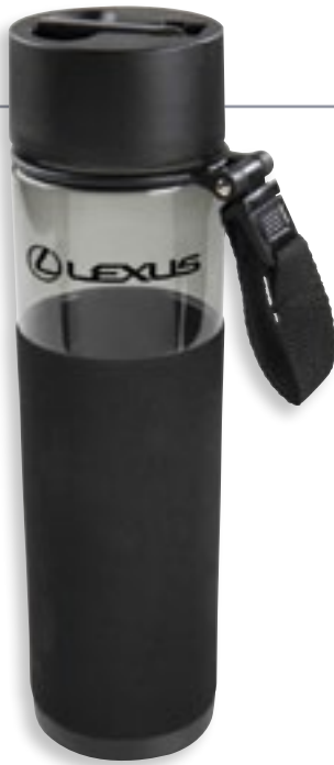
LEXUS ALTA™ SPORT BOTTLE Refillable BPA-free bottle features a screw-on, flip-top lid; hinged carrying strap; and insulating neoprene sleeve that keeps beverage cool and hands dry. 24 oz. 00625-19130-400