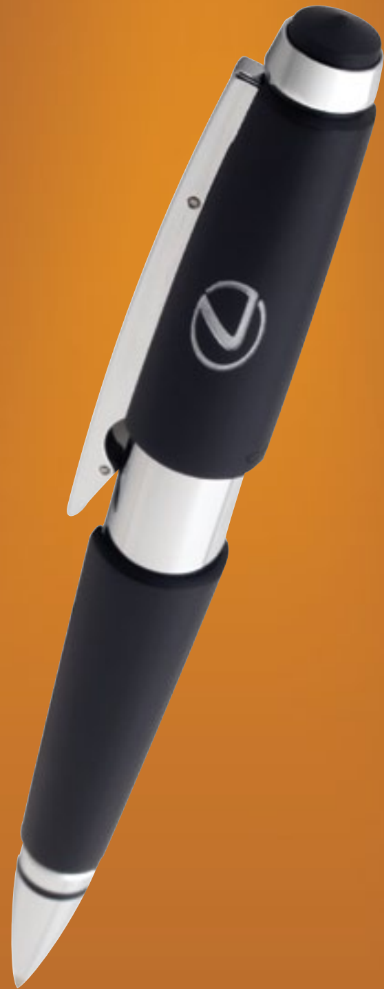
CROSS® EDGE Premium quality and sophistication. Capless rollerball slides open, snaps shut—no twisting or clicking necessary. 00625-19147-000