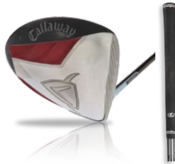
CALLAWAY® DIABLO OCTANE DRIVER Engineered from revolutionary Forged Composite™ material that is lighter and stronger than titanium for reliable high performance. Matching head cover included. 00625-19145-699