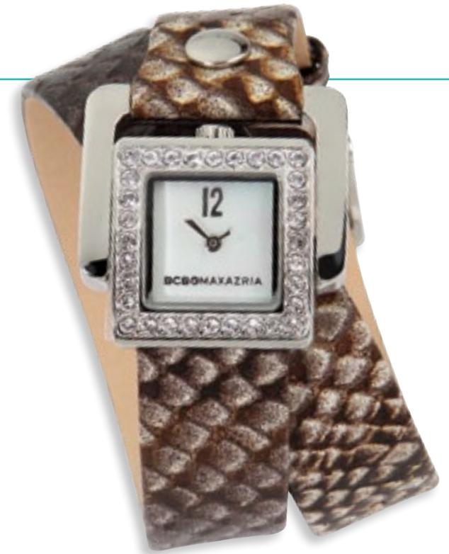
BCBGMAXAZRIA WRAP WATCH Totally chic, double-wrap snakeskin-embossed leather strap with adjustable buckle closure. Stainless steel case with rhinestone detail. Lexus "L" engraved on back. 00625-19141-200