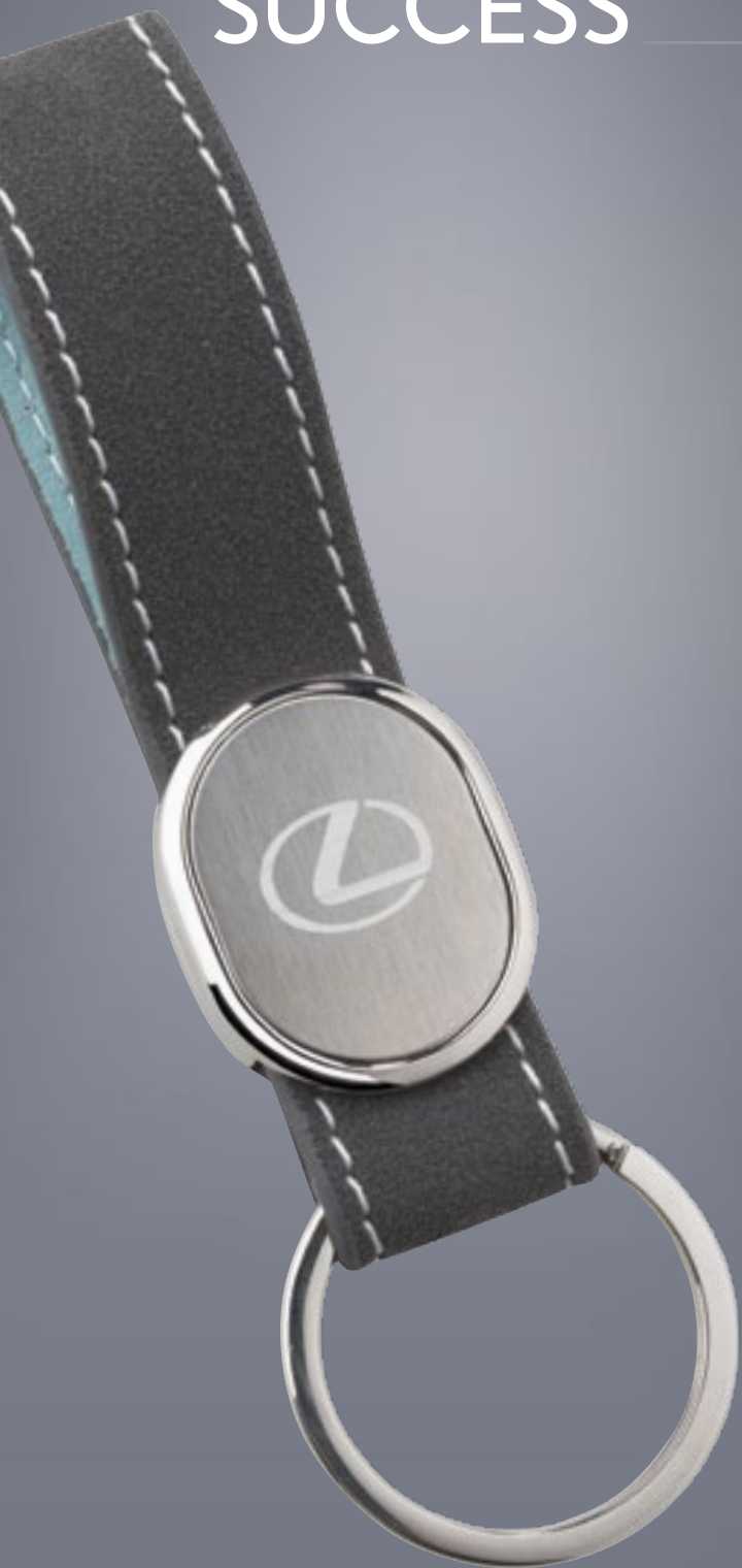
THE LEXUS LOOP Brushed stainless steel insert is elegantly engraved with the Lexus "L." Length: 4.5" 00625-19143-300