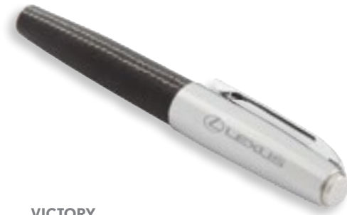
VICTORY Prominent leatherette-covered barrel with white stitching gives this two-piece rollerball a standout look. Squat styling fits comfortably in hand. 00625-19147-300