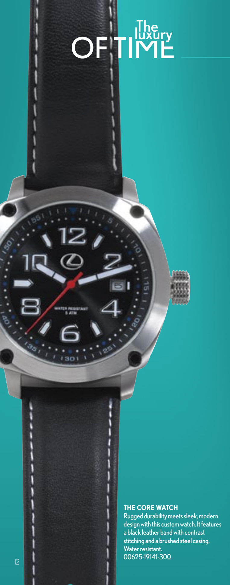
THE CORE WATCH Rugged durability meets sleek, modern design with this custom watch. It features a black leather band with contrast stitching and a brushed steel casing. Water resistant. 00625-19141-300