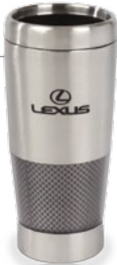
PHANTOM TUMBLER Stainless steel tumbler with push-on lid and thumb-slide closure. Unique carbon fiber design creates an intriguing optical effect. Hand wash. 16 oz. 00625-19141-900