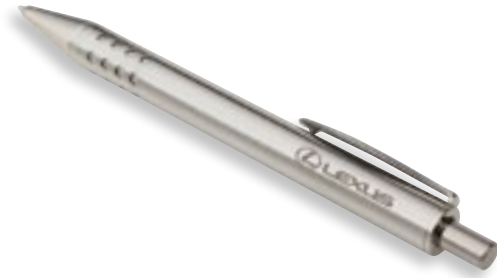
STEINBERG Traditional click-action pen is a standout for smooth performance. 00625-19131-600