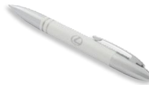
LEXUS TWIST Twist-action ballpoint with metallic lacquer-finish barrel and chrome tip and accents. 00625-19147-100