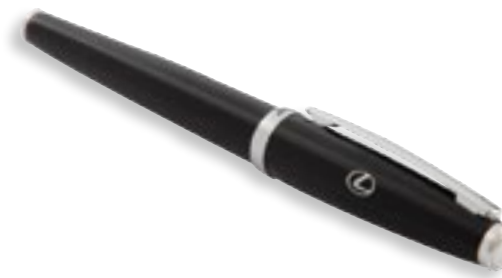
CALLAWAY® WENTWORTH Two-piece rollerball has a rich, high-gloss enamel finish. Perfectly proportioned for smooth performance. Leatherette case. 00625-19146-900