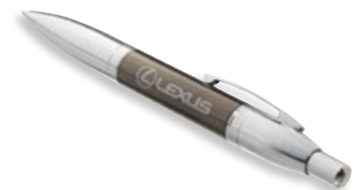
CHROME BAND BALLPOINT Weighty solid brass pen with click-action mechanism, and high-gloss gunmetal finish. 00625-19121-400