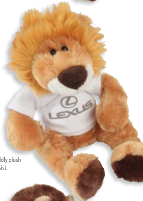
LEXUS FLOPPIES With their long floppy legs and cuddly plush bodies, these cuties are hard to resist. 7" sitting. 00625-19147-400 Dog 00625-19147-500 Lion 00625-19147-600 Monkey