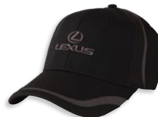
PERFORMANCE CAP Sporty styling includes mesh overlays at front panel and visor edge. Black. One size. 00625-19143-000