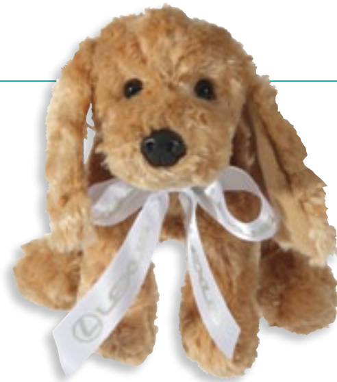
PUDDLES THE DOG His soft curly fur, cute round nose and long floppy ears will melt anyone's heart. 8" sitting. 00625-19122-500