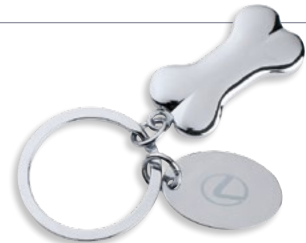
... MY DOG GONE KEYS Shiny, split-ring key holder carries a weighty dog-bone-shaped charm and a smooth, laser-engraved Lexus logo tag. Charm length: 1.5" 00625-19143-200