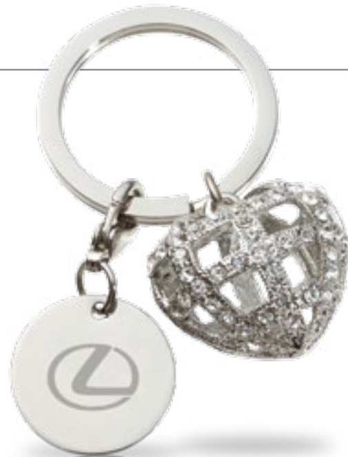
SPARKLE HEART KEY RING Highly polished nickel key ring pairs a three dimensional, glittering crystal heart charm with a smooth, laser-engraved Lexus logo tag. Length: 2.5" 00625-19117-900