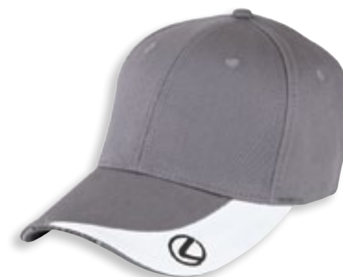
LEXUS PURSUIT CAP Look closely at the edge of the bill: you'll see the words "The Pursuit of Perfection" subtly woven in. Structured chino twill, embossed buckle closure. Slate. One size. 00625-19126-000