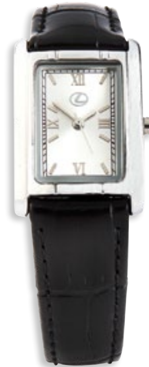
LEXUS LADIES' CLASSIC Traditional features get an updated look. Analog wristwatch with textured leather band displays the Lexus "L" discreetly on face. 00625-19146-100