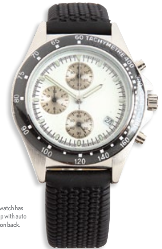
TIRE WATCH Attention-getting chronograph sport watch has tachymeter bezel and rubberized strap with auto tire tread pattern. Lexus "L" engraved on back. 00625-19141-400