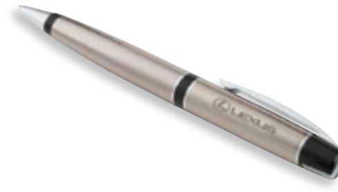
MONONA Nothing compares to the feel of a weighty, solid brass writing instrument. This one is exceptional, with duo-tone styling and smooth, twist-action operation. 00625-19131-700