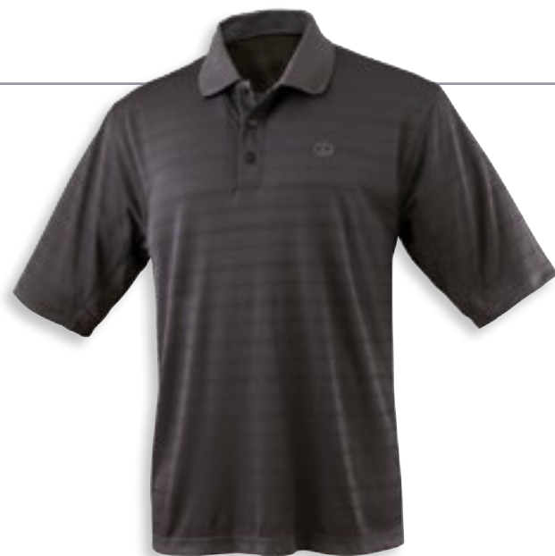
TEXTURED STRIPE POLO Action-ready polo with subtle, textured striping offers stay-dry moisture control and UV sun protection. Mesh side panels enhance breathability. 100% polyester. Black. M-XXL 00625-19145-59*