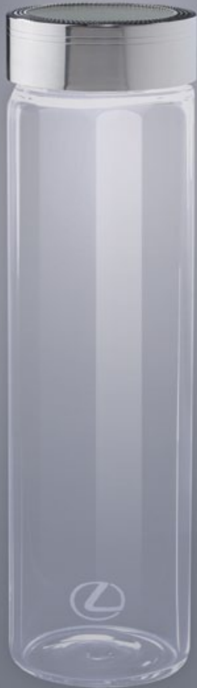
GLASS H 2 GO® Clearly, a different way to transport beverages. Slender, cylindrical glass container with screw-on lid. Dishwasher safe without lid. 18 oz. 00625-19141-800