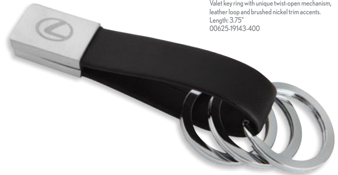
TWISTER KEY RING Valet key ring with unique twist-open mechanism, leather loop and brushed nickel trim accents. Length: 3.75" 00625-19143-400