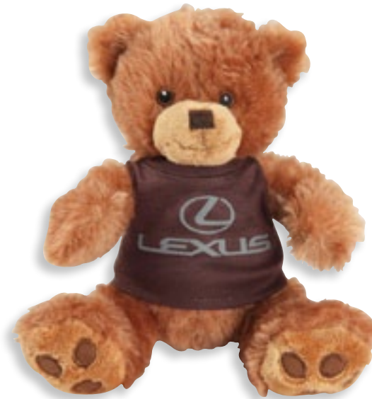
PATCHES PAW THE BEAR Soft, huggable bear is washable with embroidered eyes, nose and paws, so is safe for all ages. 8" H 00625-19132-600