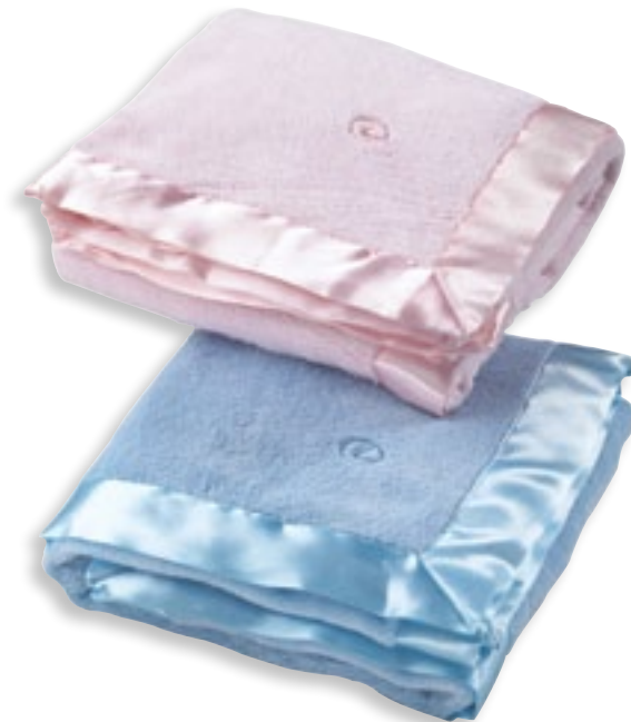
LEXUS BABY BLANKET Ultra-soft and snuggly, microfleece blanket with satin edge finish is sure to be baby's favorite. 33" H x 40" L 00625-19148-000 Pink 00625-19147-900 Blue