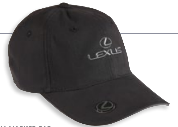
THE BALL MARKER CAP Medium brushed twill unstructured cap keeps you cool and comfortable, and holds a magnetic ball marker within easy reach. Embossed clip buckle closure with grommet. Charcoal. One size. 00625-19102-800