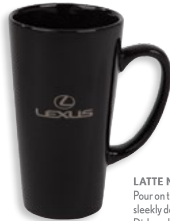
LATTE MUG Pour on the impact with this tall, sleekly designed heavy ceramic mug. Dishwasher and microwave safe. 16 oz. 00625-19141-500