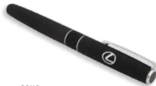
SOHO Elegant, soft-grip rollerball offers exceptional writing comfort. Two-piece construction. 00625-19147-200