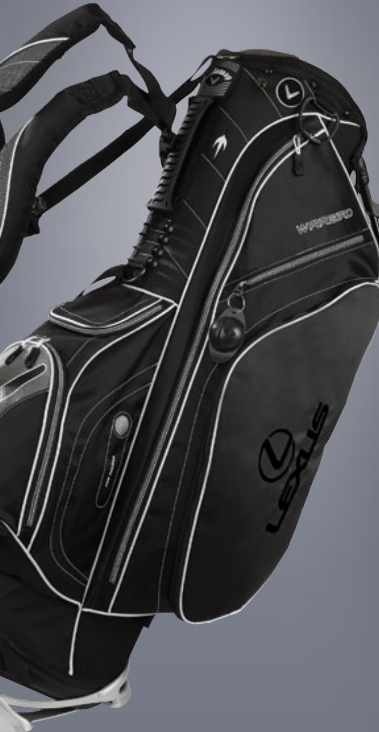
CALLAWAY® WARBIRD STAND BAG The ultimate stand bag—lightweight, spacious, stable. Features 9" oval top with seven-way divider system and durable frame construction. Weighs just six pounds. 00625-19145-700