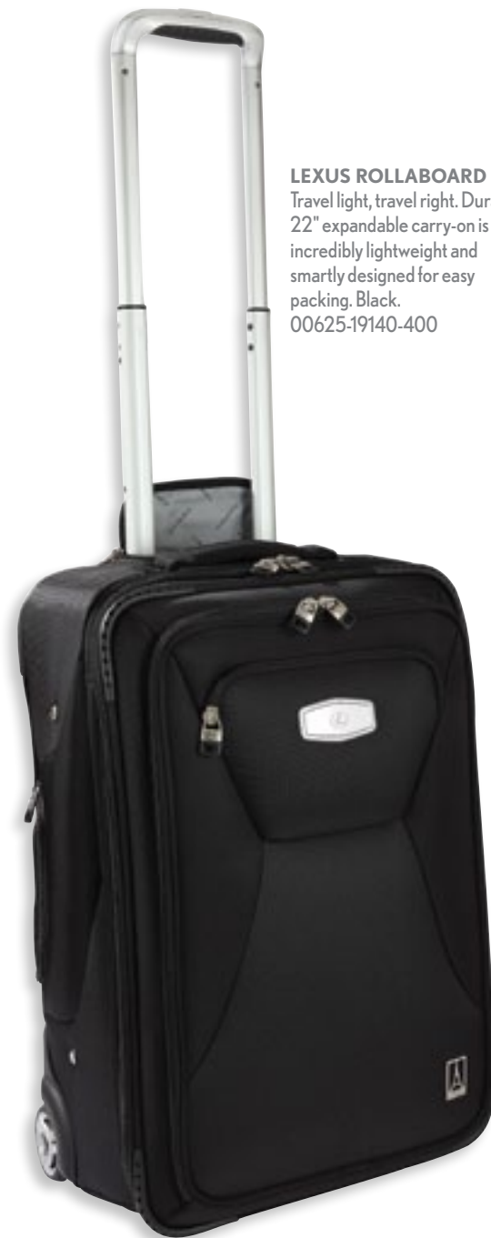
LEXUS ROLLABOARD Travel light, travel right. Durable 22" expandable carry-on is incredibly lightweight and smartly designed for easy packing. Black. 00625-19140-400